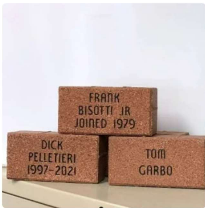
4" x 8" Brick $75.00

Orders taken will be completed and installed in the spring of 2025.