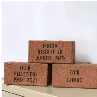
4" x 8" Brick $75.00

Orders taken will be completed and installed in the spring of 2025.