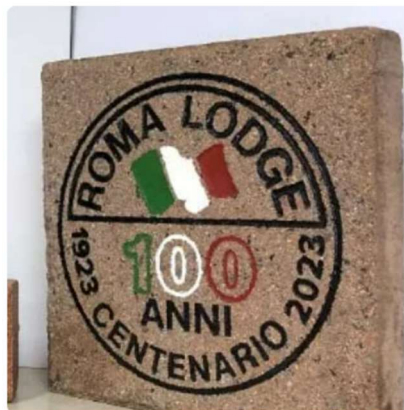
12" x 12" Brick $200.00