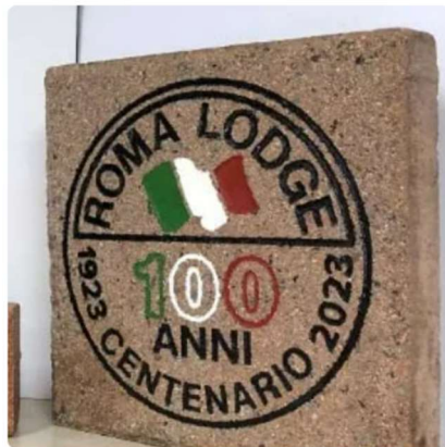
12" x 12" Brick $200.00