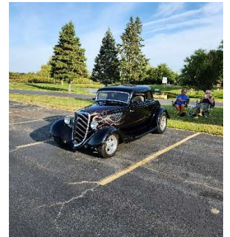
Bob Blake 1934 Ford (all steel car)