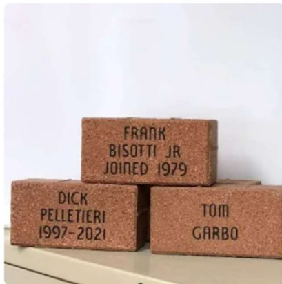
4" x 8" Brick $75.00

Orders taken will be completed and installed in the spring of 2025.