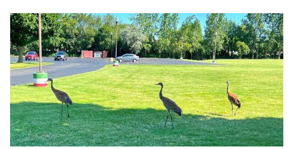
Not all our visitors were people!